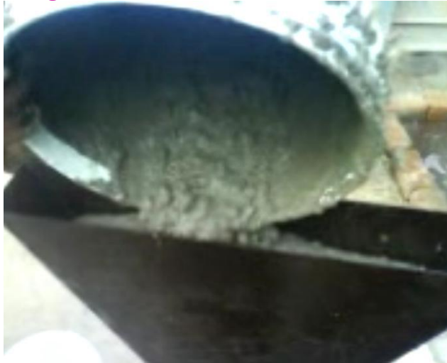
Figure 2: V – Funnel test