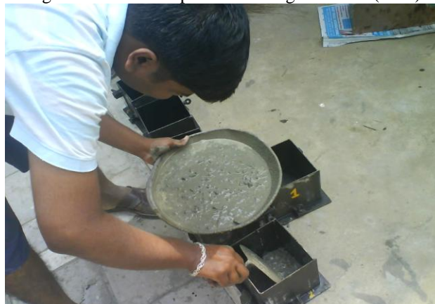
Figure 7: Cube Casting