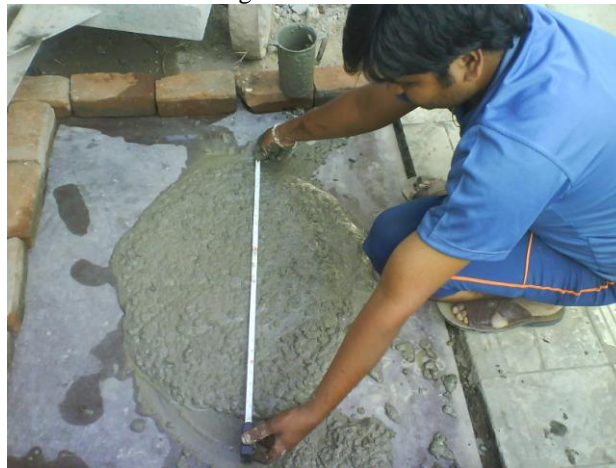
Figure 3: Slump flow test