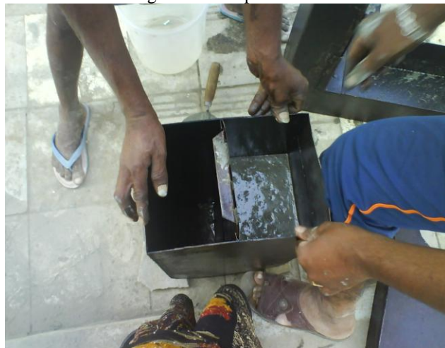
Figure 4: U box test

Nine standard cubes each for various percentages were tested to determine the 7- days, 28- days, 56- days compressive strength and results are given in table-VI