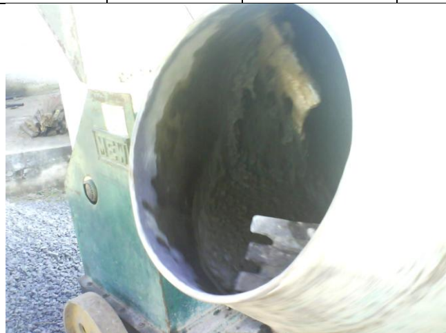
Figure 1: SCC Mixing In Mixer Machine